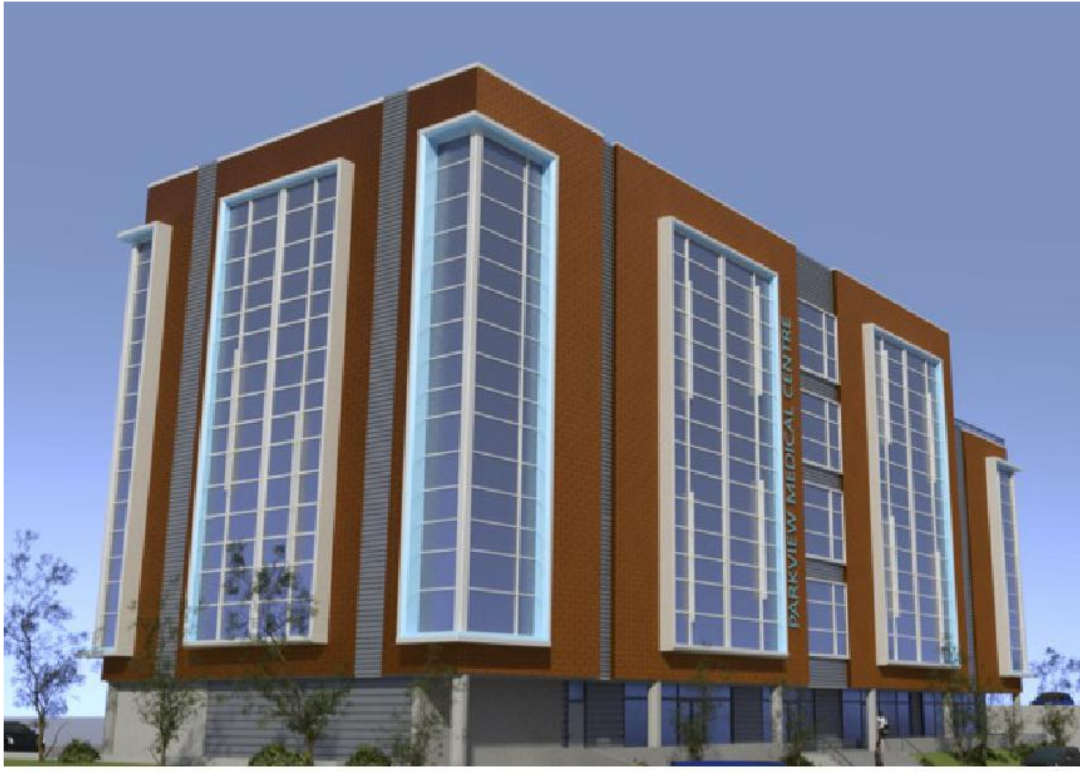
4 VIEW FROM SOUTH-WEST OF BUILDING FRONTING SEAFIELD CRESCENT