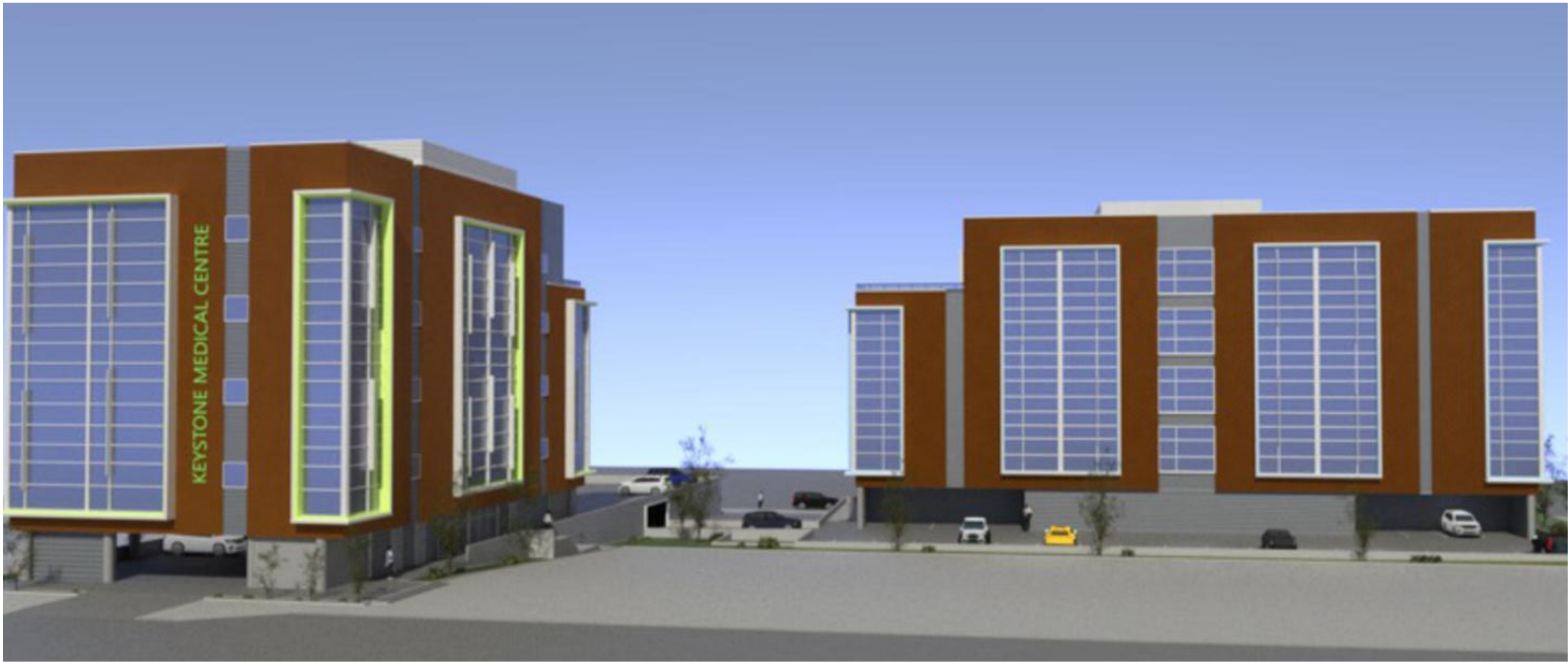
1 VIEW FROM NORTH-WEST ALONG DUFFERIN CRESCENT