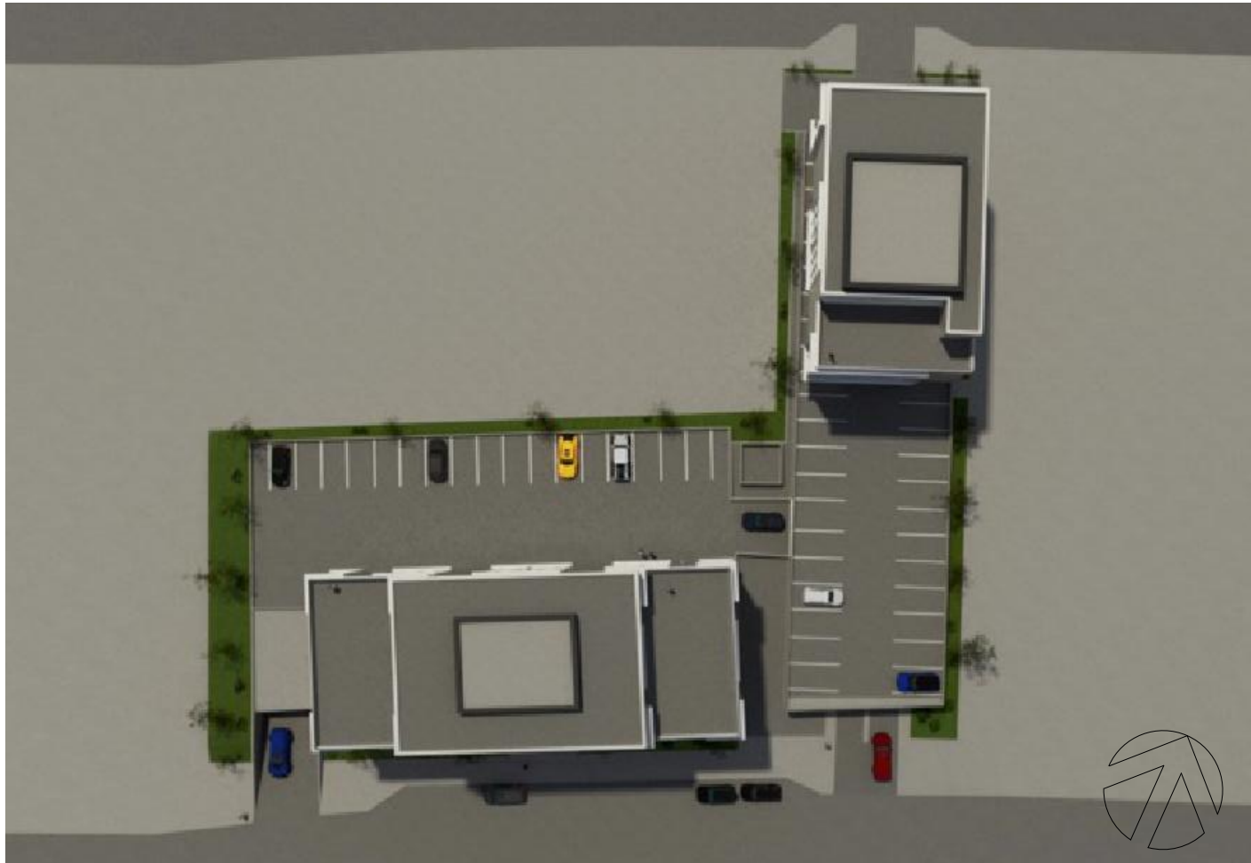
7 JUNE AT 3PM