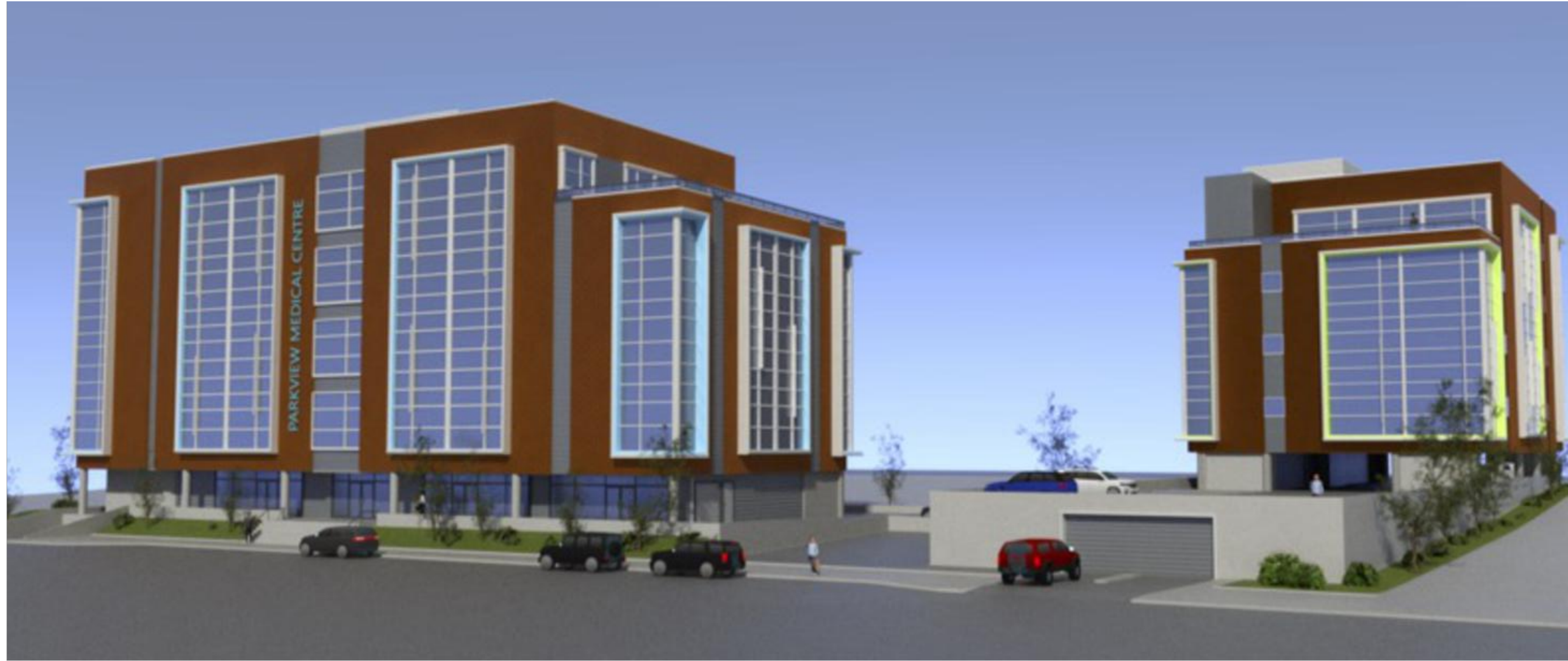
2 VIEW FROM SOUTH-EAST ALONG SEAFIELD CRESCENT