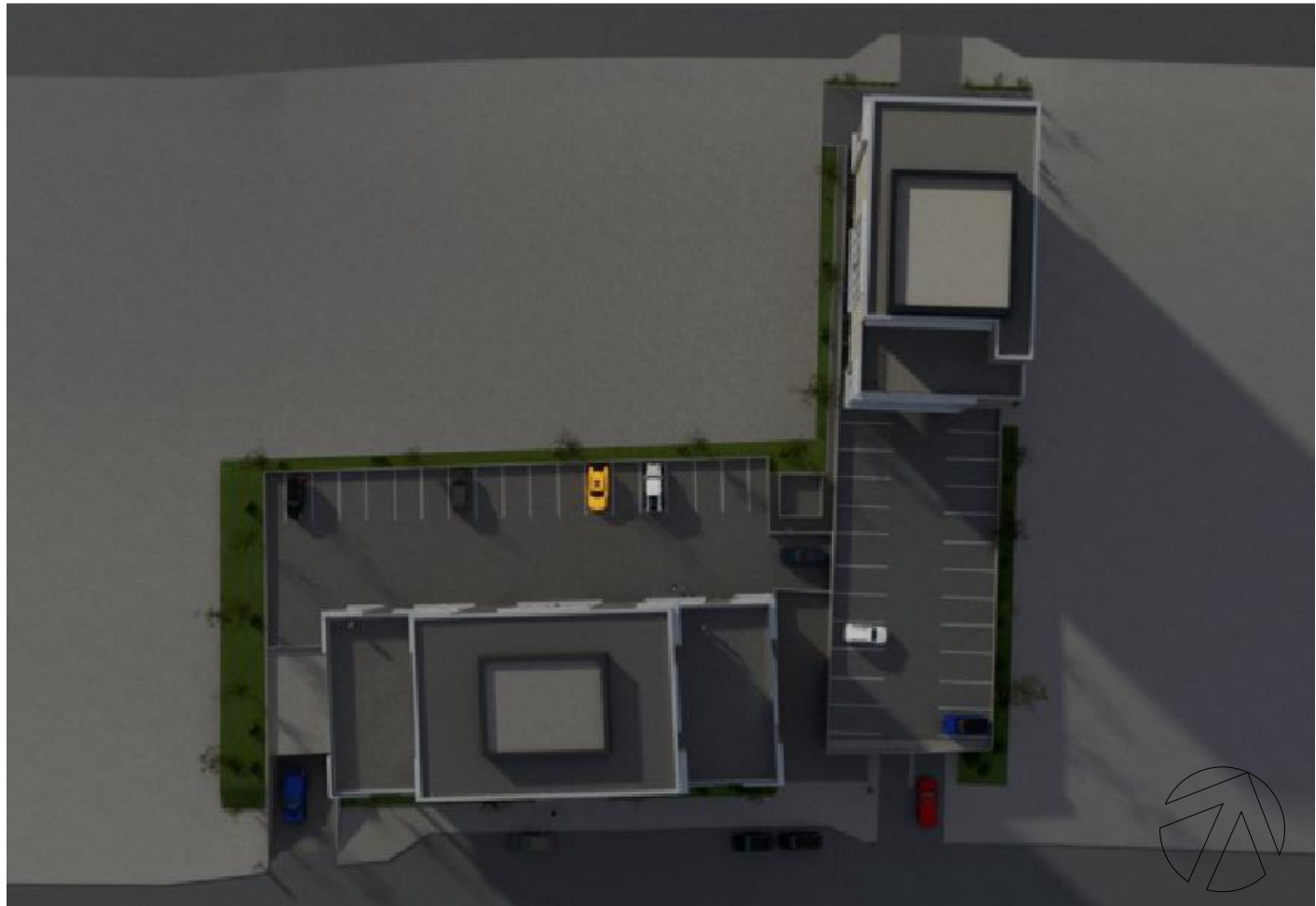
5 DECEMBER AT 3PM