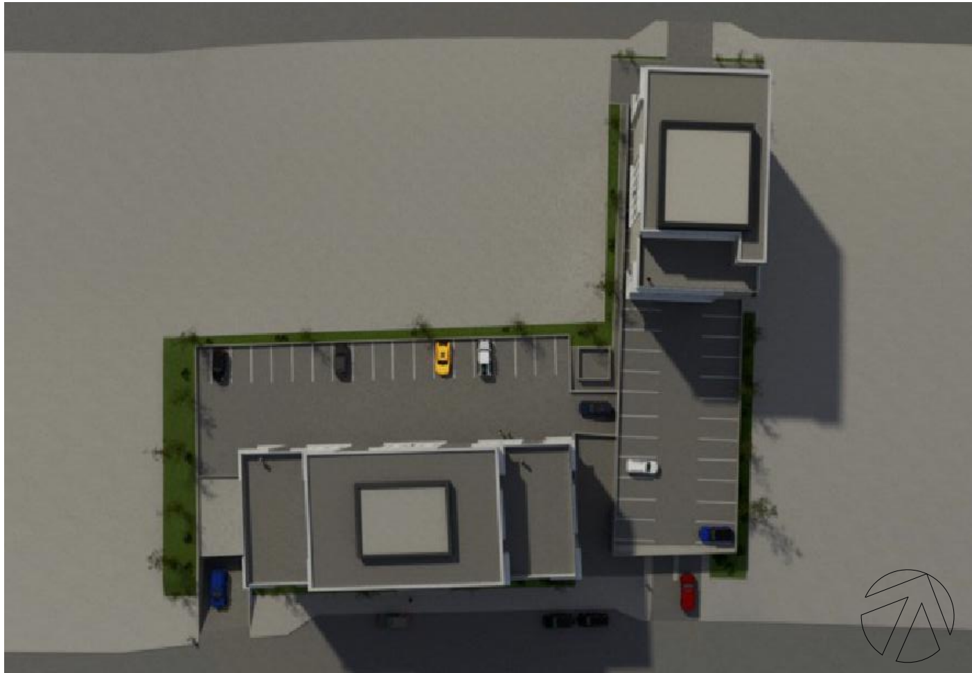
8 SEPTEMBER AT 3PM